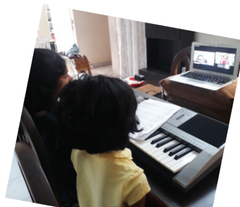
Music lessons continue as usual