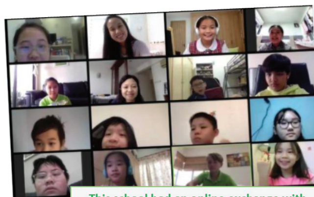
This school had an online exchange with students from Thailand and South Korea